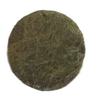
Biocompositepb (aftered sample)