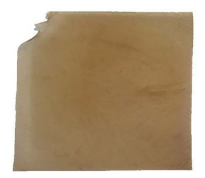
Biofilm (altered sample)