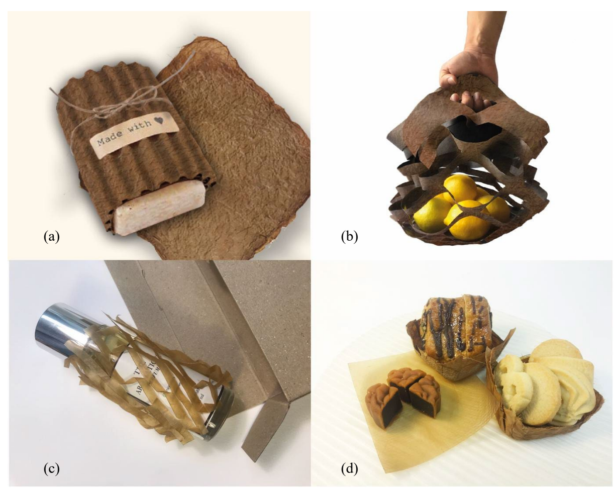
Figure 6: Proposed packaging design: (a) gift box, (b) fruits bag, (c) alternative 'bubble wrap', (d) biscuits and pastries serving box.