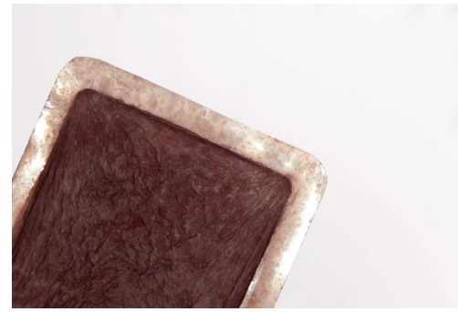
Figure 2: Samples of semi-developed Kombucha biomaterial (Emma Sicher, 2018)

Many product designers have developed Kombucha biomaterial to substitute plastic, textile and animal leather (see the above Figure). As the biomaterial is entirely grown from cellulose film, no animal is exploited in the production. Also, water and energy use are less intensive than the production of mainstream materials. Hence, the carbon footprint of Kombucha biomaterial is relatively low. However, developers are still refining the finishing treatment for the biomaterial. For sustainability reasons, they opt not to use harmful chemicals typically used to treat material surfaces.