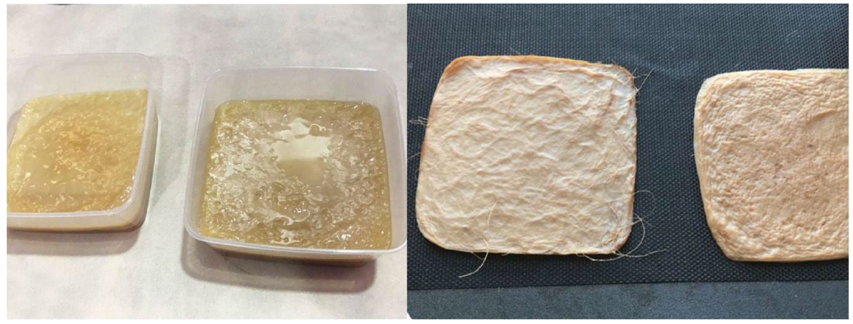
Figure 4: Bacterial cellulose in growth medium (left) and sun-drying and texture imprinted process (right)

Several sessions of physical manipulation were conducted on the materials after the cultivation and processing were complete. The tinkering process allowed the designers to develop a comprehensive understanding of the materials, including their sensorial, performative, affective, and interpretive aspects. Specifically, the tinkering studies were conducted with the materials to understand their properties, behaviour under different manipulation, and opportunities. As shown in Figure 5, the material samples were bent, cut, weaved, pulled, soaked and moulded. The step enables material developers to be intuitive, like an artisan, relying on cognitive process and physical-experiential capacity to read the behaviour of the materials.