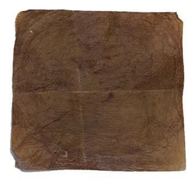
Control (unaltered sample)