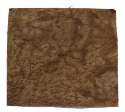
Biocomposite 2 (altered sample)