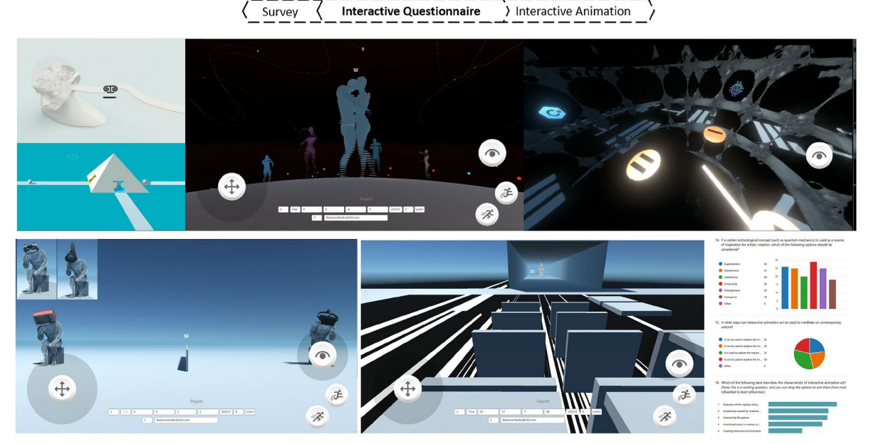
Figure 1 Interactive Questionnaire 'The Quantum Art Gallery'

perspective to design an interactive questionnaire (Figure 1). Quantum art combines art and science, interpreting phenomena through quantum physics concepts. The practice aims to visualize interactions, randomness, interference, superposition, and emergence, constructing a new paradigm for cultural and artistic creation. By utilizing online interactive animation, it collects first-hand data for analysis while investigating the constraints and facilitations posed by media technology. The research adopts an interpretive paradigm, emphasizing subjective understanding of individuals' cultural and social context, experiences, motivations, and artistic processes in 3D interactive animation art. Boden (2005, pp. 1–2) discusses how interactive artworks can incorporate unpredictability and the repeated denial of expectations. Creativity, viewed as both fascinating and mysterious, poses a challenge for scientific understanding due to its inherently unpredictable nature (Boden, 2004, pp. 13, 233, 254).